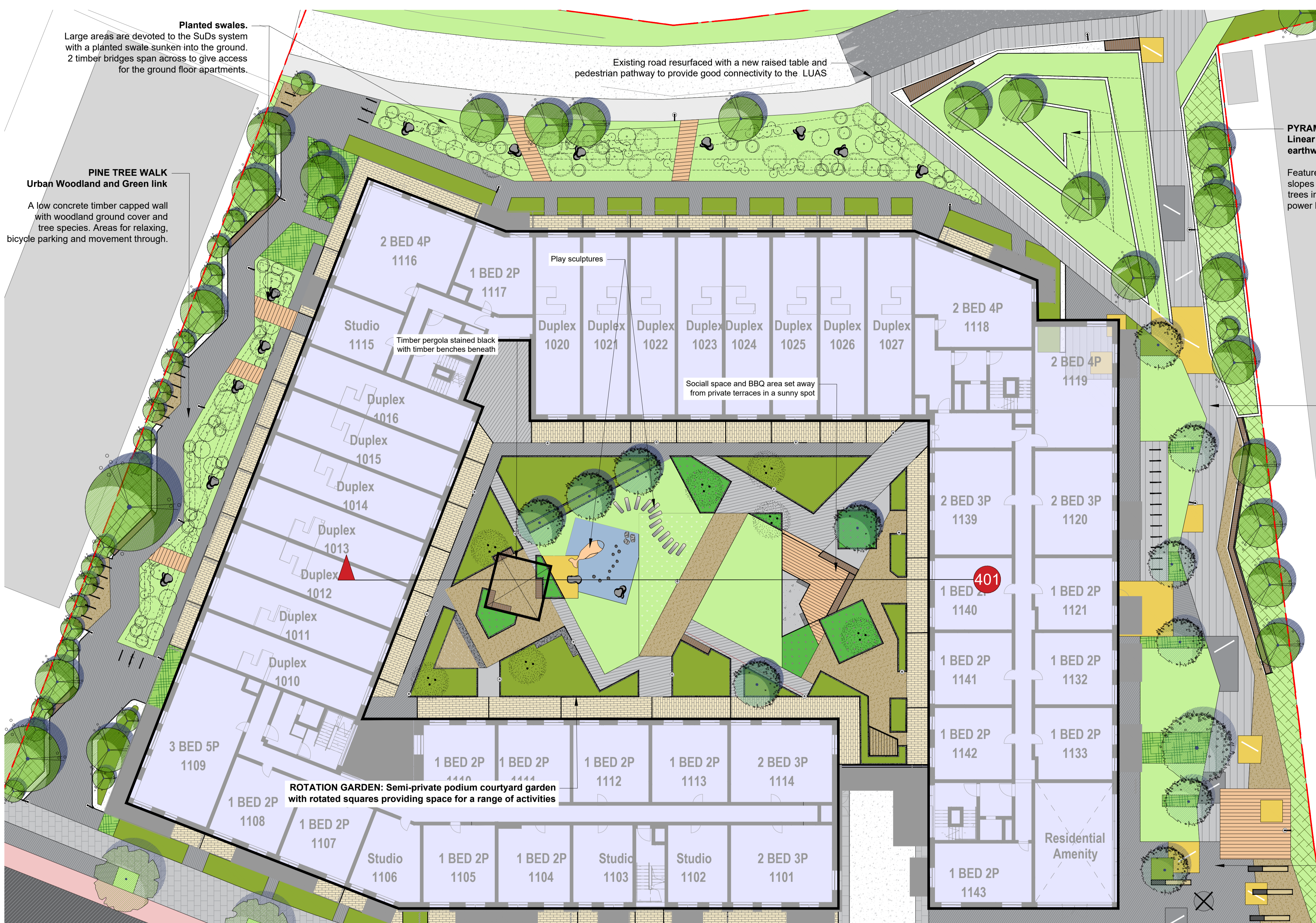
Block A Area plan - scale 1:200