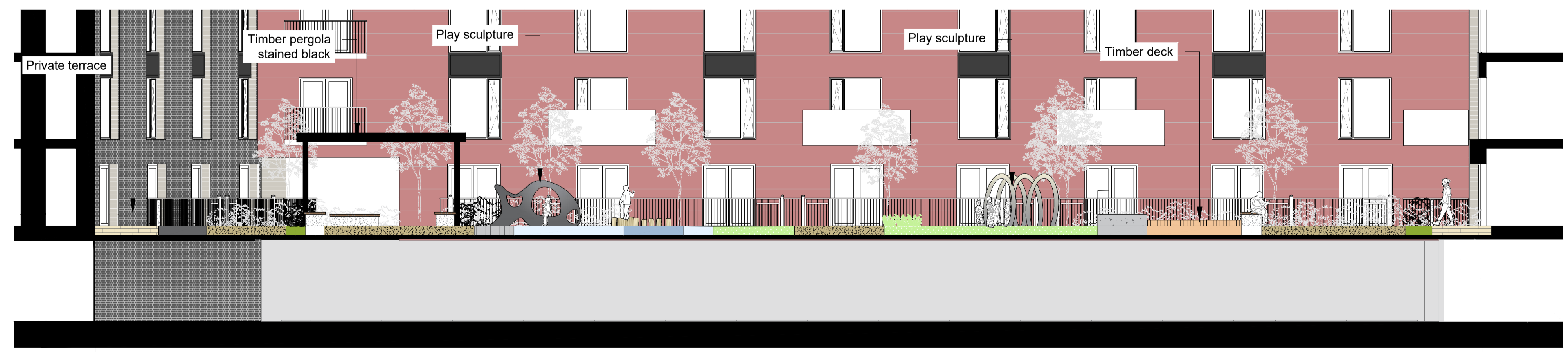
Section 401 - Block A - Rotation Garden podium courtyard section - scale 1:100